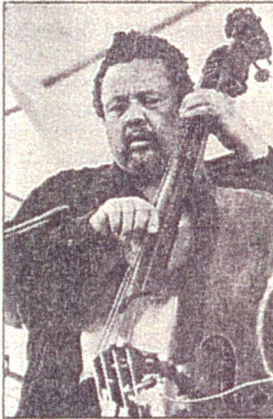
Mingus: The jazz great performing in the mid-'70s

Brilliant, eccentric composer/bassist/bandleader Charles Mingus' shifting ensembles from the '50s to the mid-'70s spawned many giants of the post-bop era. With reissue-giant Rhino Records exploring serious jazz (look for its seven-volume Masters of Jazz series this summer), 1975's exuberant Mingus at Carnegie Hall is now on CD. A sax-fest of Jon Faddis, John Handy, Rahsaan Roland Kirk and Charles McPherson joins Mingus' then-new group in this joyous jam honoring Duke Ellington, whose C Jam Blues , say the original LP's liner notes, is "the common denominator of jazz."