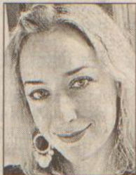
By Brian Fassett

'Crazy' cancer: On Valentine's Day in 2003, actress Kris Carr was diagnosed with Stage 4 cancer. The unpronounceable name: epithelioid hemangio-endothelioma — a rare vascular cancer that affects the lining of the blood vessels in her liver and lungs, as she describes it. So rare, there is no cure and no definitive treatment plan, she says. Carr's doctor suggested a "wait and watch" approach to see if the tumors grew. That's when Carr, 36, decided to turn into a "healing junkie" with immune-building nutrition and exercise. And she became as creative as all get-out, producing a documentary, Crazy Sexy Cancer , which aired on TLC last week, and a new book, Crazy Sexy Cancer Tips (Skirt! Books; just went back to press; total in print: 115,000). Carr is on a book tour (more information at crazysexycancer.com ). The good news: Her cancer is in a holding pattern. "Cancer needed a makeover," she says, "and I was just the gal to do it."